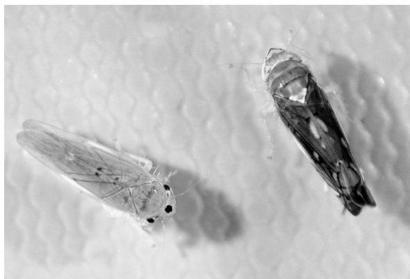
Figure 2 - Adultes of P. cyclops (left) and S. titanus (right).

possible between larvae, adults are easier to tell apart (figure 2). In our study, very few individuals of P. cyclops were observed compared to S. titanus (10 P. cyclops against 15,000 S. titanus ), which would not lead to significant underestimates of P. cyclops . However, with high P. cyclops populations, like the ones observed in Italian vineyards (BRACCINI and PAVAN, 2000), misidentification could be significant.