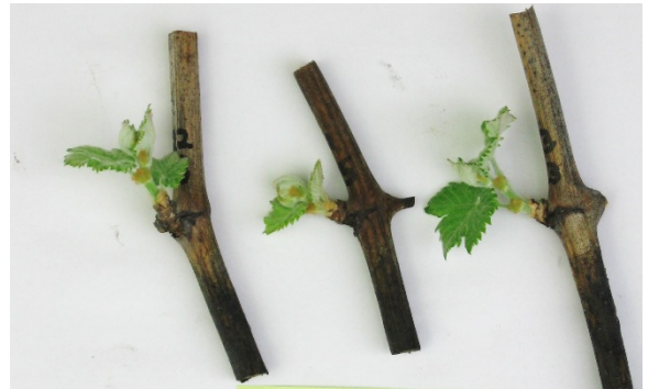
SUPPLEMENTARY FIGURE 1. The four different bud stages used in Figure 4, Experiment 3, as described in Coombe (1995).