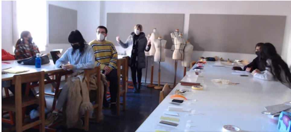
Figure S1. Images illustrating the creative process of touch reference materials