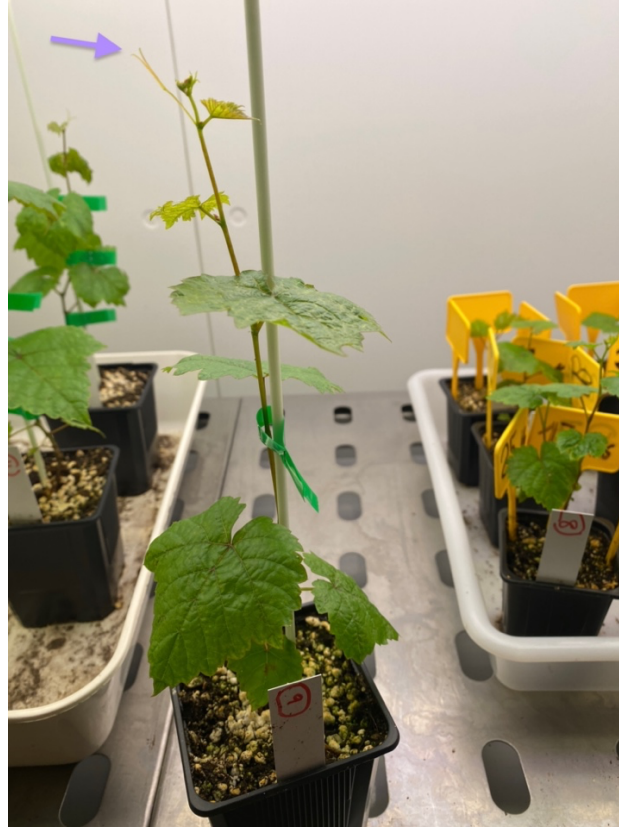
Figure S1. Representative adult plant showing the appearance of the first tendril.